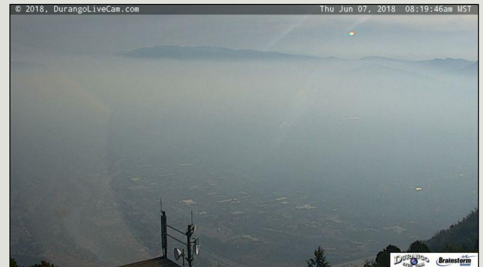
Durango, CO 6/7/18