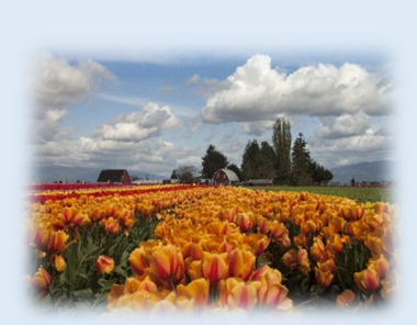
Skagit Valley tulip field