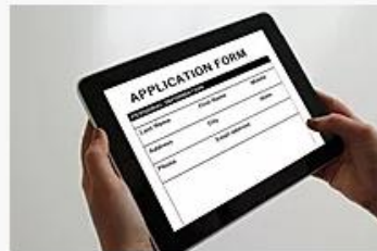
Permit Application Forms

This is a “catch-all” category with examples of agency webpages containing permit application materials (including general permits) and Clean Air Act permitting guidance directed at the general public.