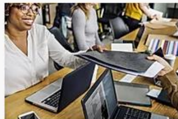
Guidance and Technical Support Materials