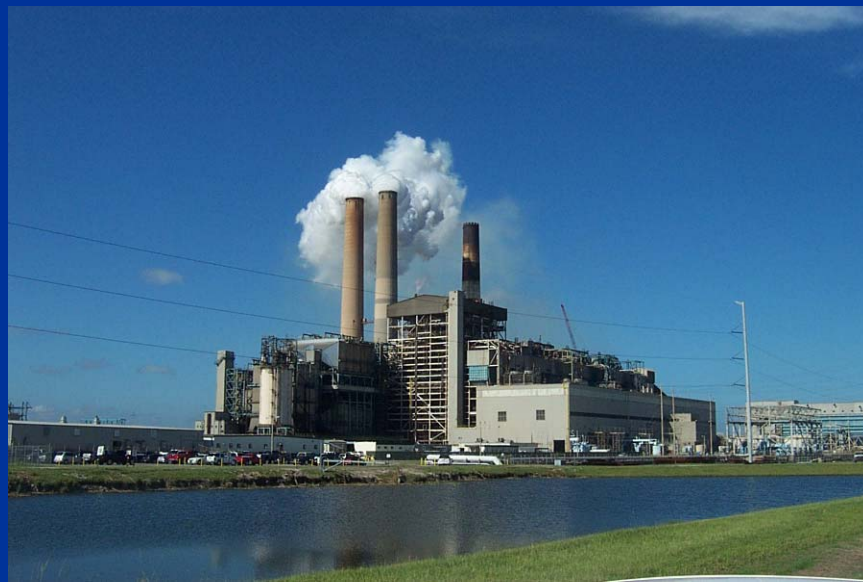
TECO Big Bend