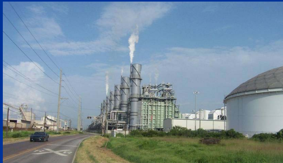
TECO Bayside EPC of Hillsborough County